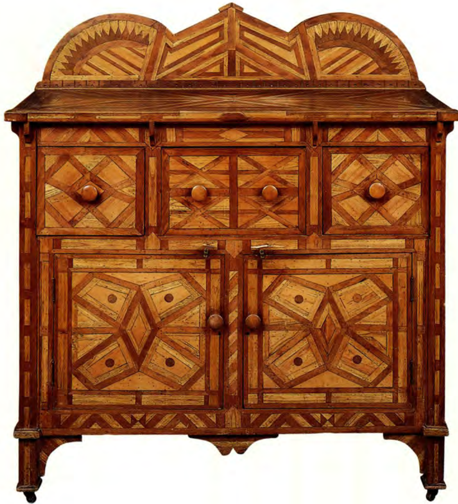
SIDEBOARD WITH THREE DRAWERS OVER TWO CABINETS Maker unidentified Northwestern Vermont 1900–1915 Parquetry 55¼ × 50¾ × 22¼"