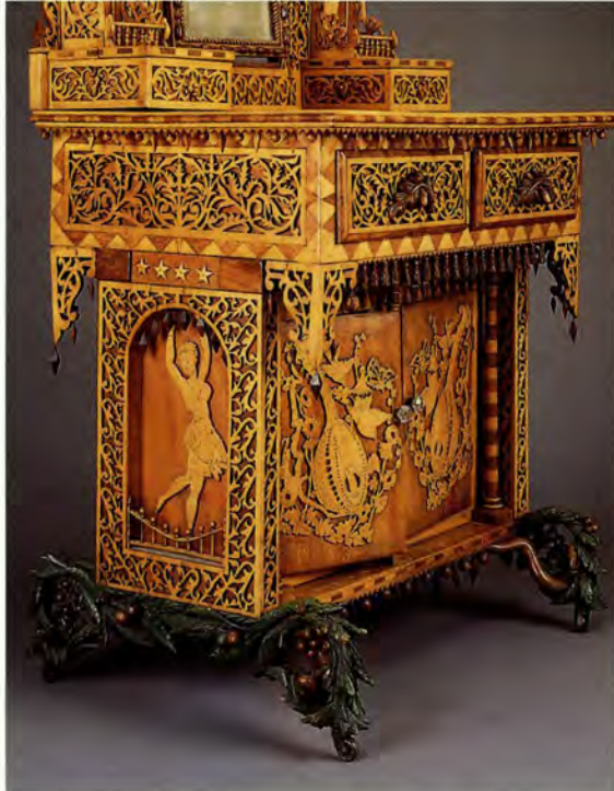
Detail of STATUE OF LIBERTY CABINET The dancing bacchante, a figure borrowed from an ancient source, is symboli- cally linked to the Statue of Liberty at the top of the cabi- net. The dancer celebrates the dedication of the monument.

a symbol of Islam, but here it is likely the symbol of the Eastern Star, the women's branch of Masonry—Albrecht may have made the cabinet for a woman who belonged to this auxiliary.