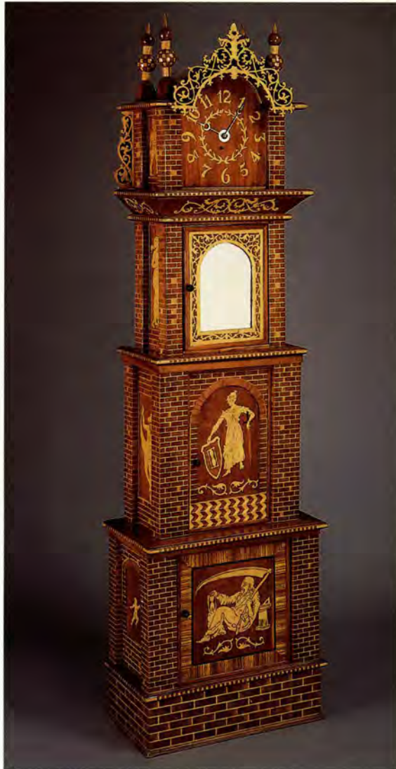
TIERED TALL CLOCK Maker unidentified United States c. 1880 Parquetry, marquetry, and jigsaw-cut openwork 91 × 25¾ × 14¾" (including pinnacles)

quantity during the eighteenth century and ceased to be made by about 1840. The form was revised around the time of the Centennial.