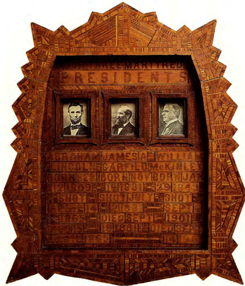
CENOTAPH TO THREE MARTYRED PRESIDENTS Maker unidentified United States After 1901 Parquetry, inlay, and photographic images printed on paper 38 × 31¼ × 1¾"

The outer frame of the plaque is a demonstration of the marquetry maker's independent vision. None of the motifs are derived from either traditional or contemporaneous frames, nor do they relate to Masonic symbolism. The side uprights resemble Crazy Quilt patterns, but the primary design source seems to be the maker's stock of handsome woods and his creative workmanship.